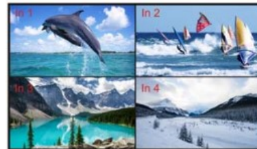
HDMI Monitor or TV